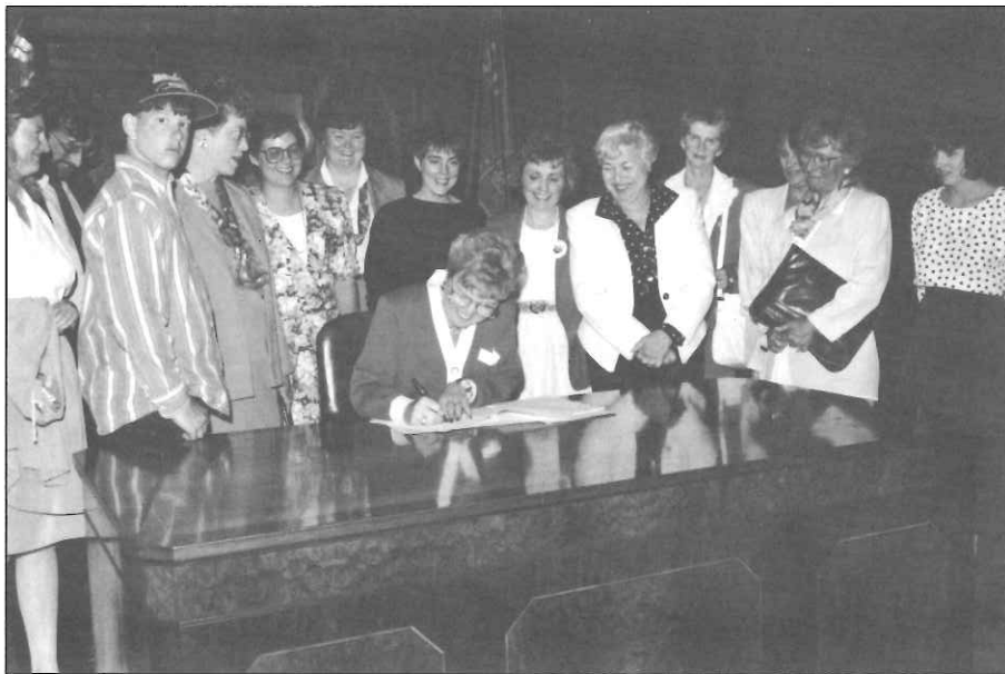
Surrounded by supporters of the bill, Oregon Governor Barbara Roberts signed House Bill 3577 into law on July 14, 1993.