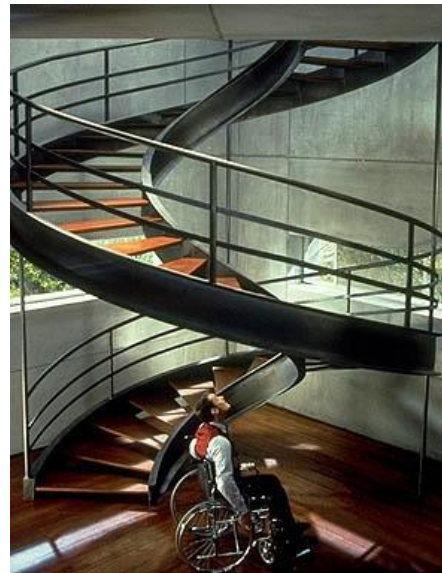
Jerome in Gattaca