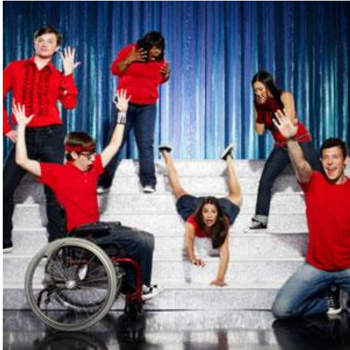
Artie in Glee