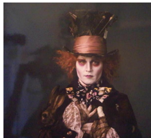
The Mad Hatter in Alice in Wonderland